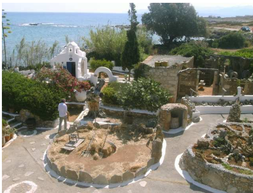
View onto a partial area of the museum with Chapel