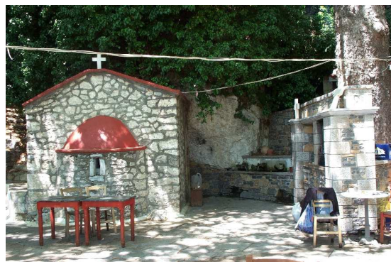
Chapel on the yard and water dispenser

At the local entrance of Christos a small sign points right towards Selekano, N 35° 5.31.95, E 25° 32.42.83 (5.8 m). The first mile of the distance is a concrete runway (see fig.), the remainder is a crushed stone and dust runway occasionally interrupted by smaller water rivulets. Nevertheless the distance to Selekano is good enough to drive with a normal passenger car.