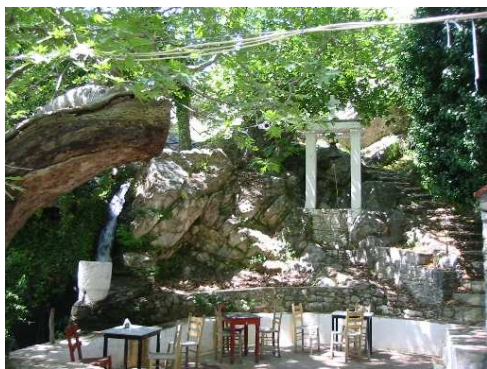
Yard of the tavern with isolated bell