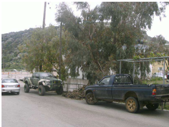
Pick-up of the priest in "NATO olive-green"