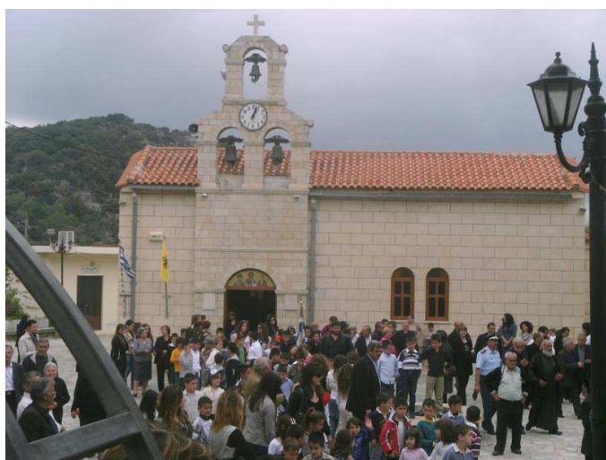
Pictures from the church courtyard during (left) and after the service (right)