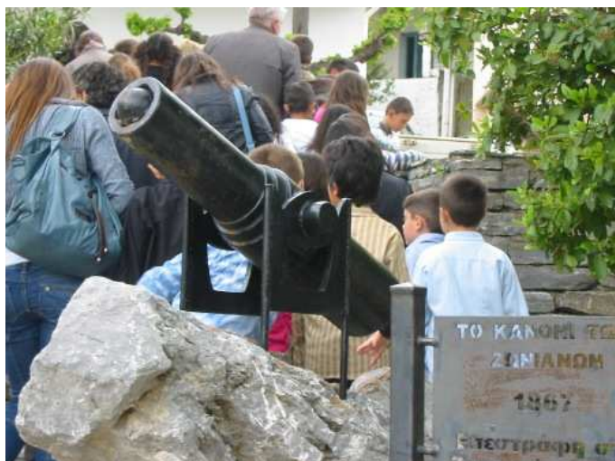
The Turkish cannon; in Zoniana since 144 years