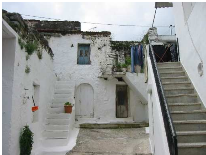
A house on the main road