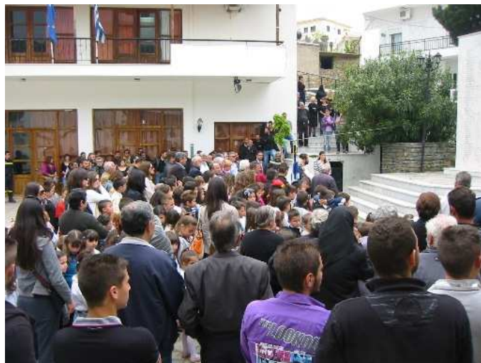
Assembly in front of the memorial